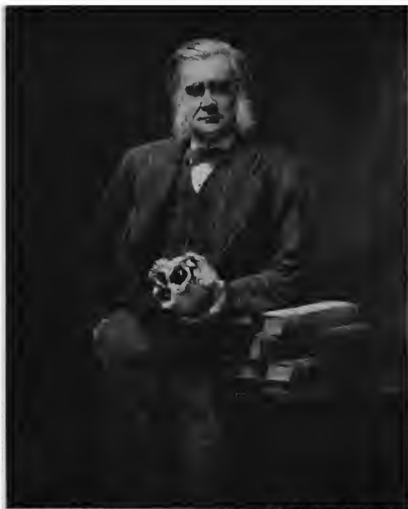
John Collier, 1880